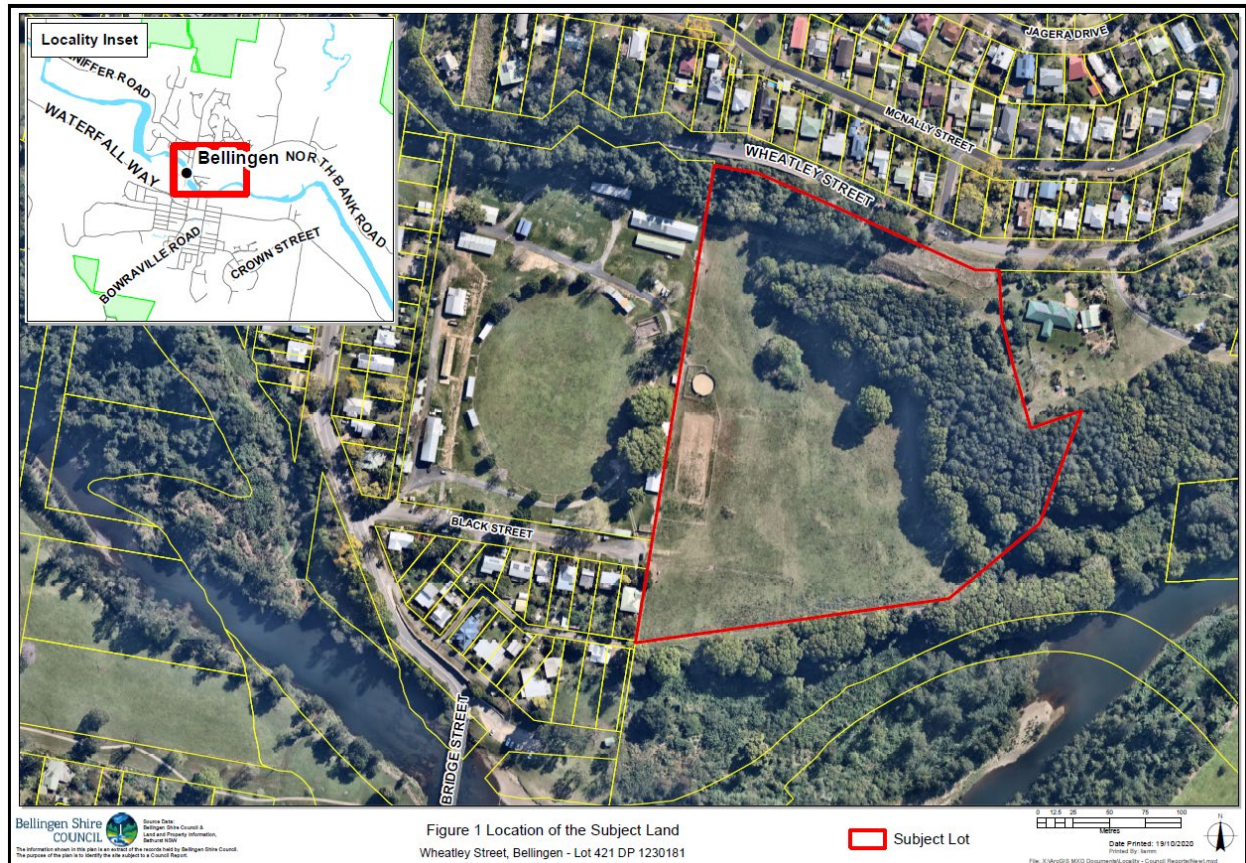
Figure 1 Location of the RE1 Zone Rezoning Proposal