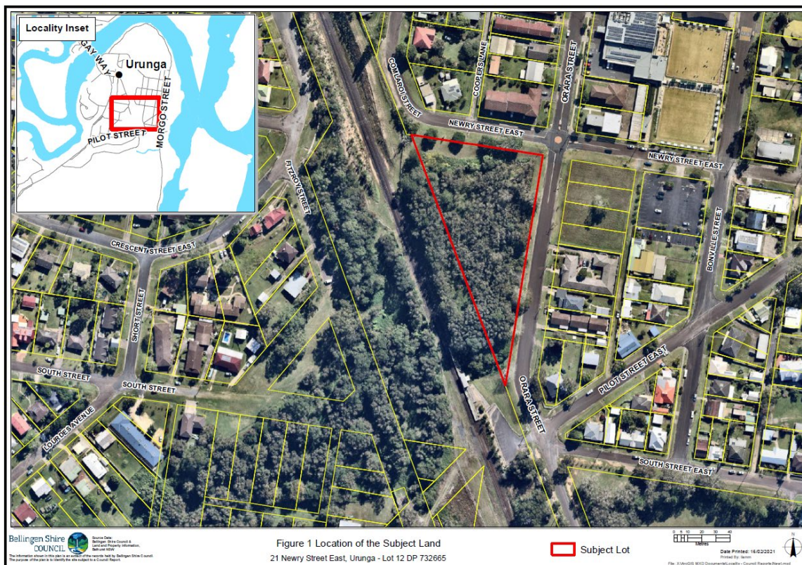
Figure 3 – Location of the E3 Rezoning Proposal